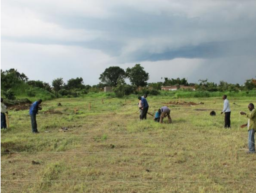
Layout of Building