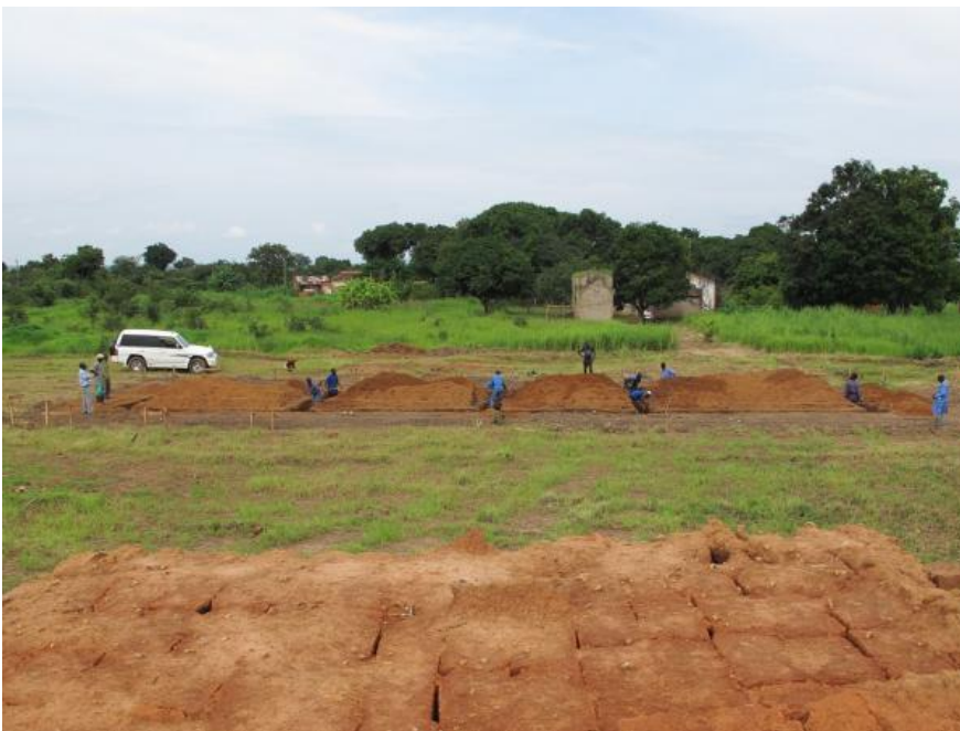
Excavation of FFH Centre Site

T +1 212 726 1089 | F +1 212 726 3109 | info@GMFafrica.org | www.GMFafrica.org